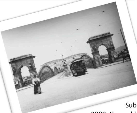
Early electric tram at the northern end of the second permanent Victoria Bridge, Brisbane c. 1906

Your school is invited to document how each of Queensland's 150 years has been remembered in your community. You will have an online space to represent each year – from 1859 to 2008 - with one selected event.